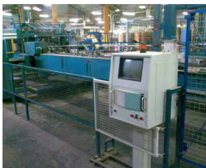
PLIEUSE & MPC2