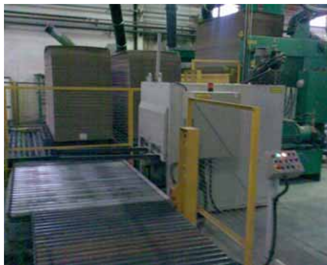
EMPILEUR PALETTE VIDE CARTEC