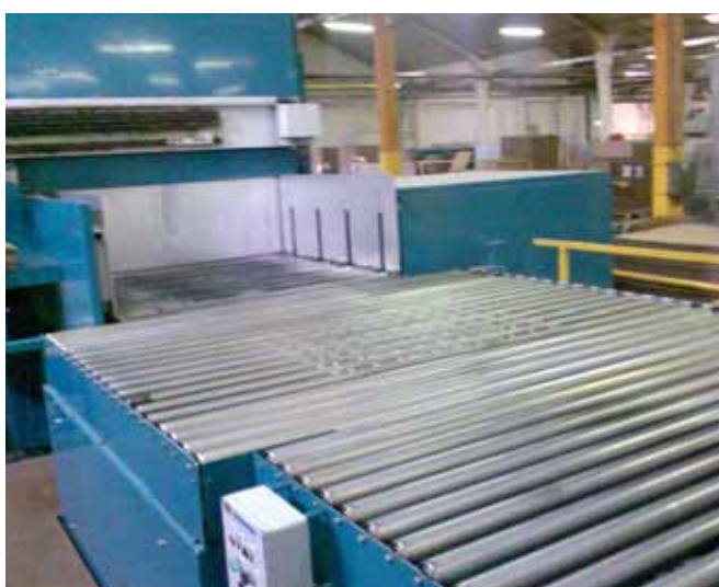
PALETISEUR FULL AUTO MARTIN