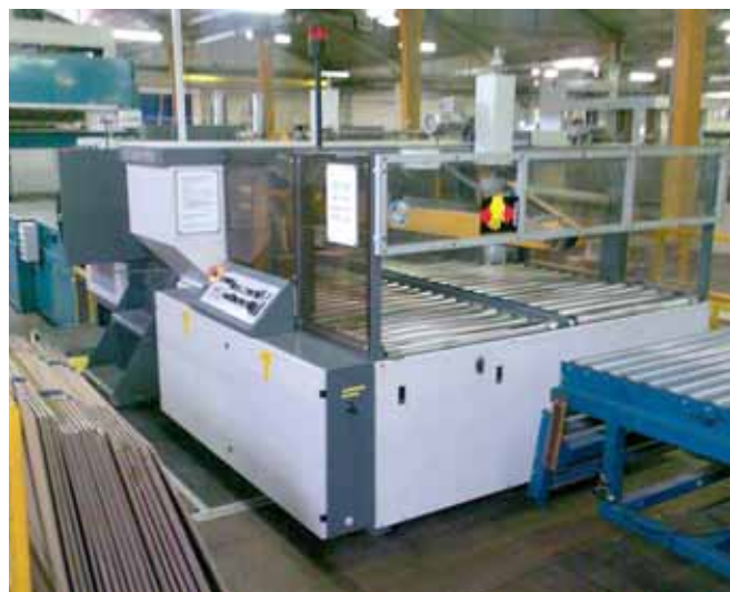
FICELEUSE ISB TWIN 1600