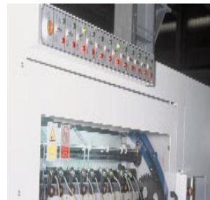
Foil break sensors